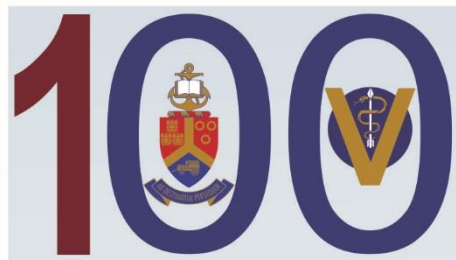
Veterinary Education & Services: 1920-2020